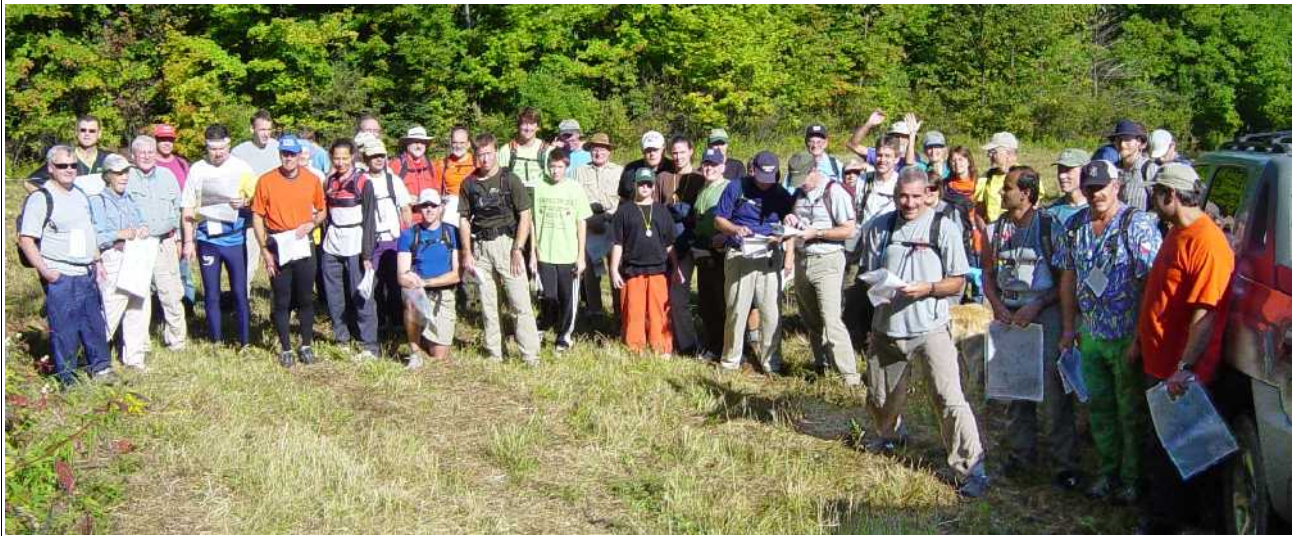
Rogaine 2005 -- The eager participants in the Rattlesnake Hill Rogaine, seconds before the start.

The official newsletter of the Rochester (NY) Orienteering Club