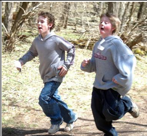
Sprinting to the finish at Mendon