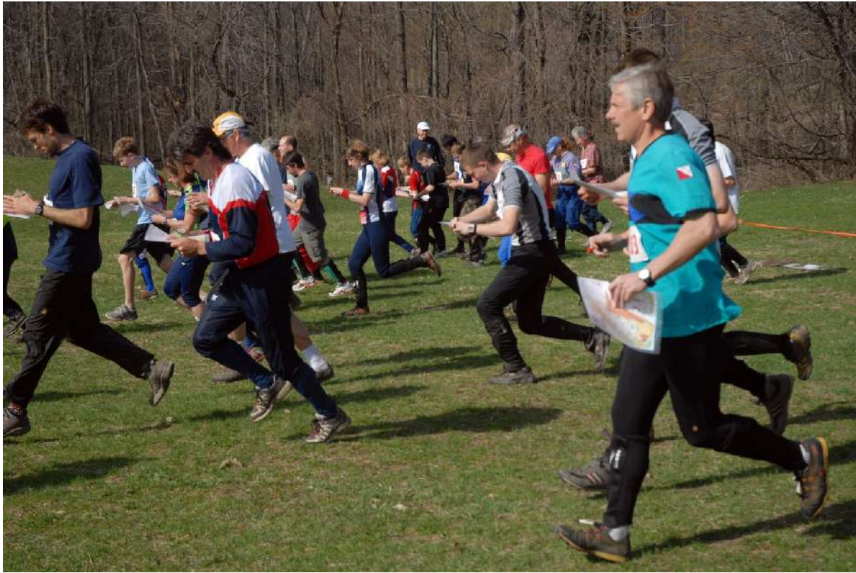
The start of the US Relay Championships, at Mendon Ponds Park.