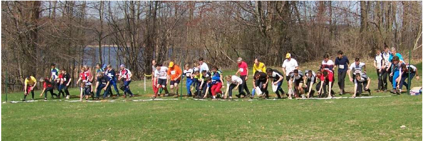
Seconds after the relay start at Mendon.