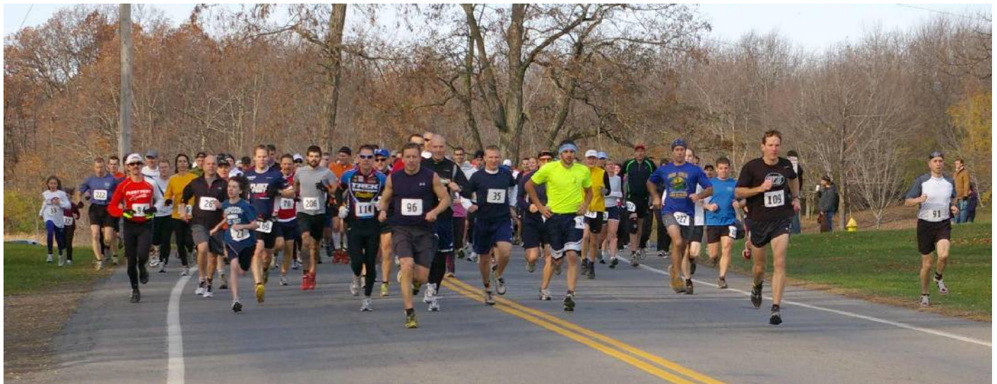
The start of the Mendon Trail Race 5K, 10K, and 20K, November 7, 2009

Rochester Orienteering Club, 40 Erie Crescent, Fairport, NY 14450